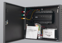
InBio-460 Package B

InBio series is an IP-based biometric access control controller with versatile and flexible functions and it is highly favored in the medium access control management projects with security requirements.