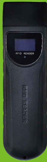
P30 Patrol stick