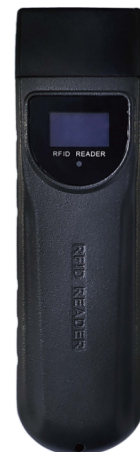
P30 Patrol stick