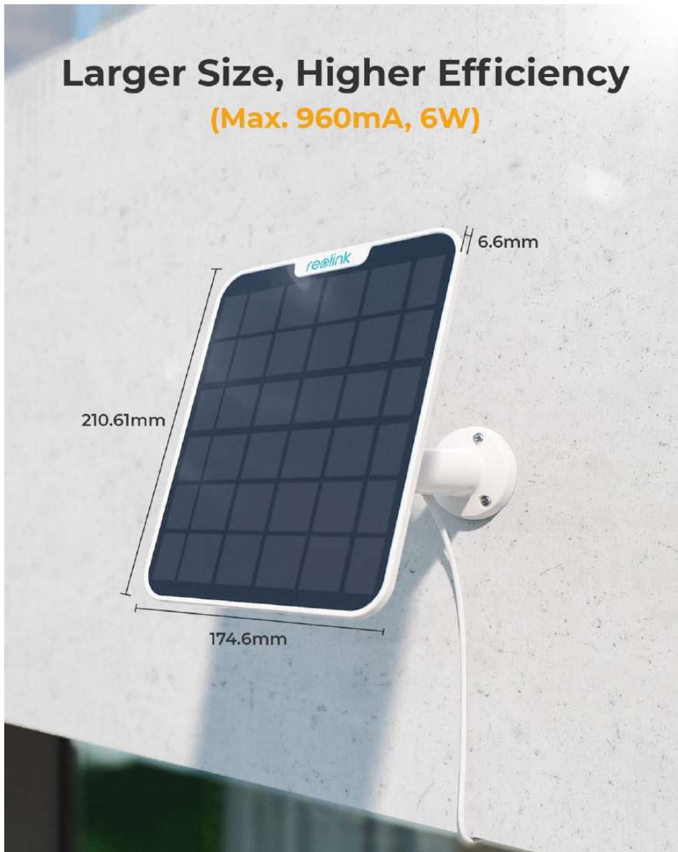
6W Solar Panel-White