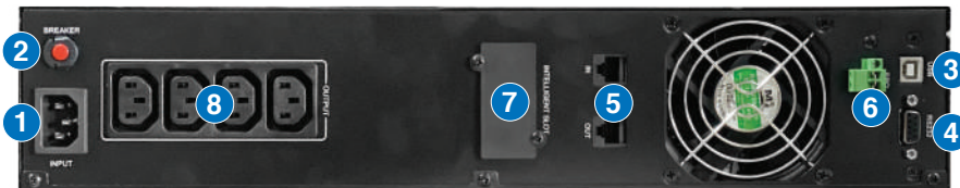
SC FR 1200 - SC FR 2000 (rear panel)