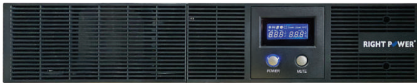
SC FR 1200 - SC FR 3000 (front panel)