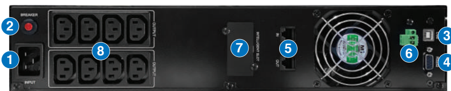
SC FR 3000 (rear panel)