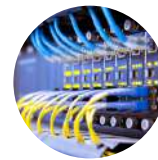
Local Area Network (LAN)