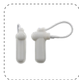
AMtag4 Tag with Lanyard Detection Distance: 1.2-1.5m