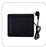
AM-D886: AM Deactivator