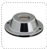
EAS-D01: Normal Detacher 4500GS