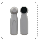
AMtag2 Small Pencil Detection Distance: 1.4-1.7m