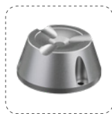
EAS-D10N: Universal Detacher 10000GS