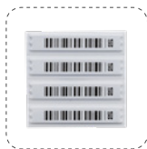
AMtag1 AM Soft tag Detection Distance: 1.2-1.5m