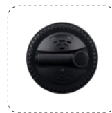
AMtag5 Spider Tag Detection Distance: 1.7-2.0m