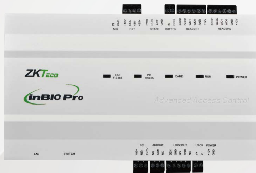
InBio160 Pro Plus