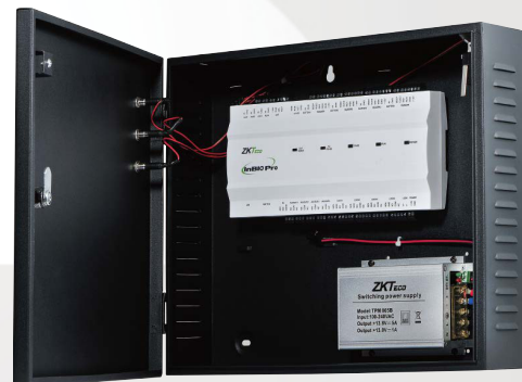
InBio460 Pro Plus Packager B

InBio Pro Plus Series is a project oriented, high-end product line with distinctive features, including embedded facial and fingerprint authentication, as well as advanced access control functions. Equipped with TCP/IP, it enables robust remote management and connectivity over local (LAN) and wide area networks (WAN), enhancing deployment flexibility and scalability. Comprising the InBio160 Pro Plus, InBio260 Pro Plus, and InBio460 Pro Plus models, the system supports up to 3,000 face templates and 20,000 fingerprint templates, a maximum of 100,000 card users, and 100,000 dynamic QRcode capacity.