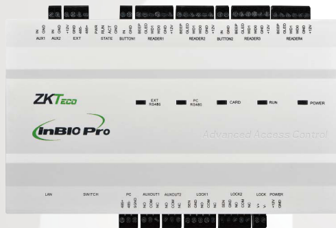
InBio260 Pro Plus